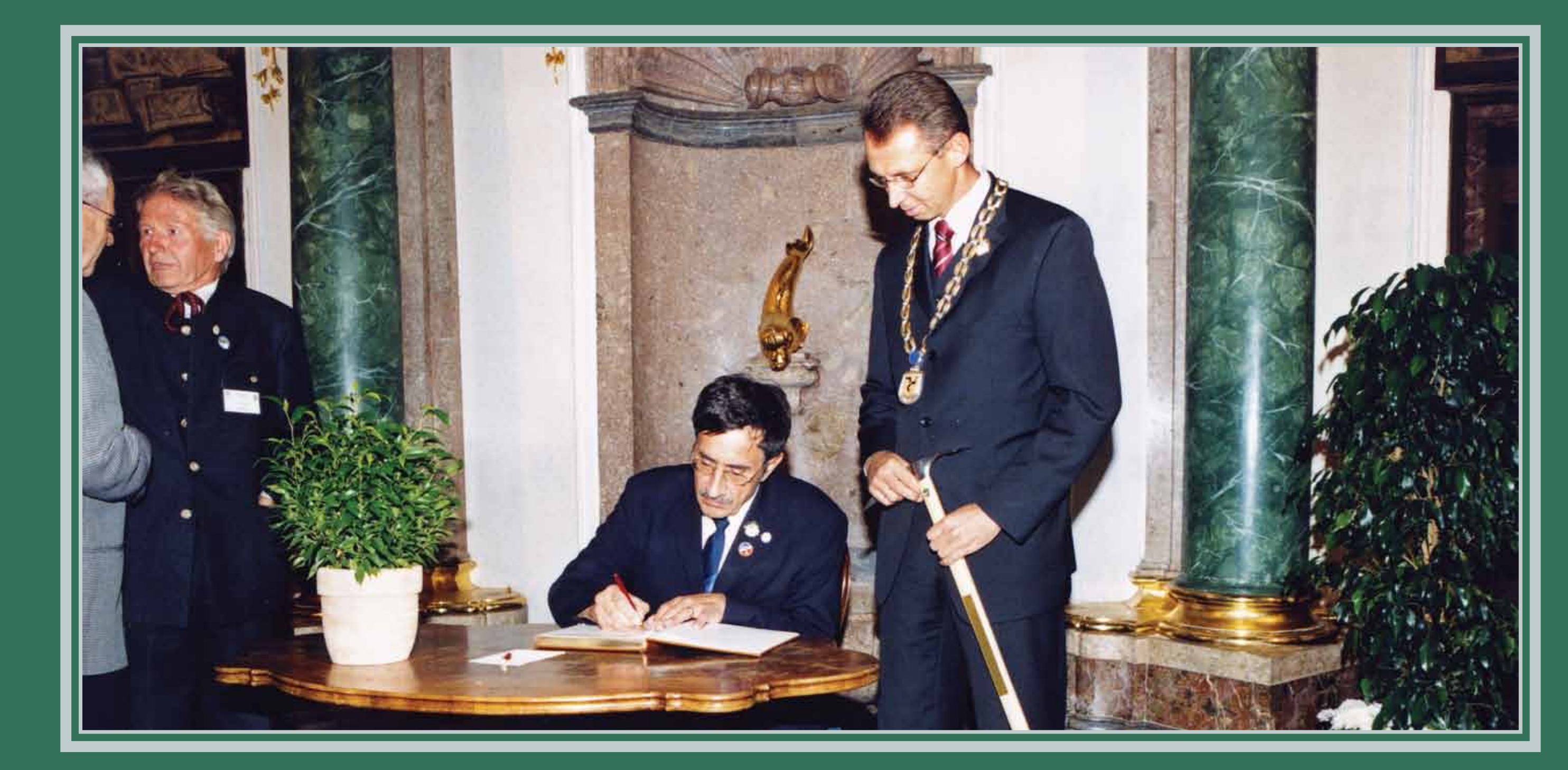
Congress in Füssen, 2003