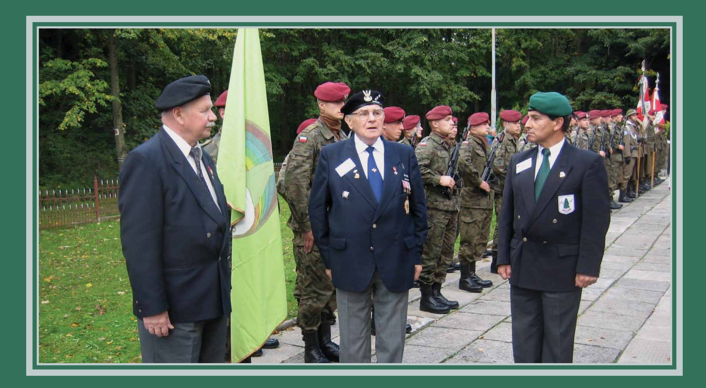
Congress in Zakopane, 2007