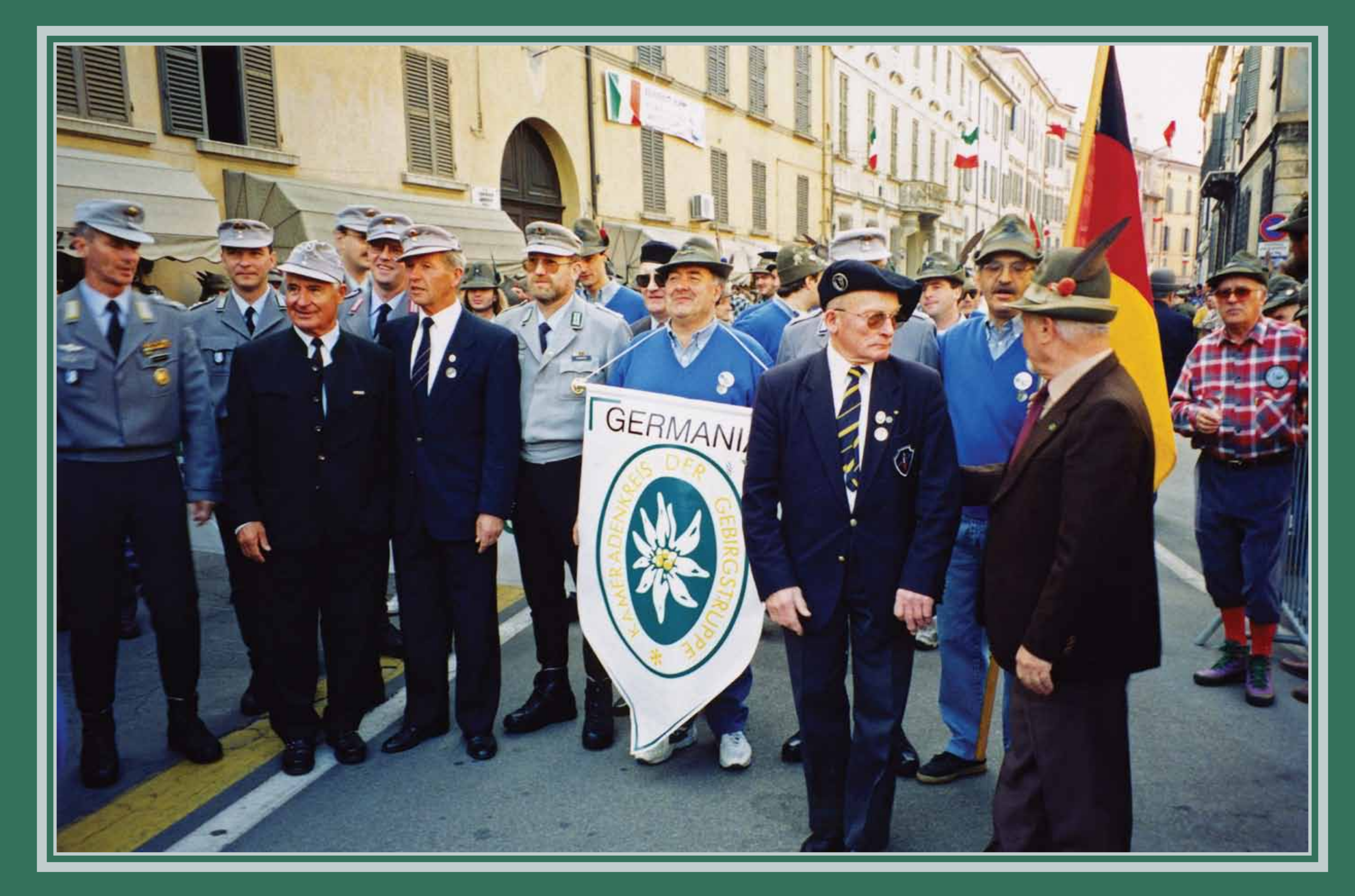
Congress in Aosta, 1995