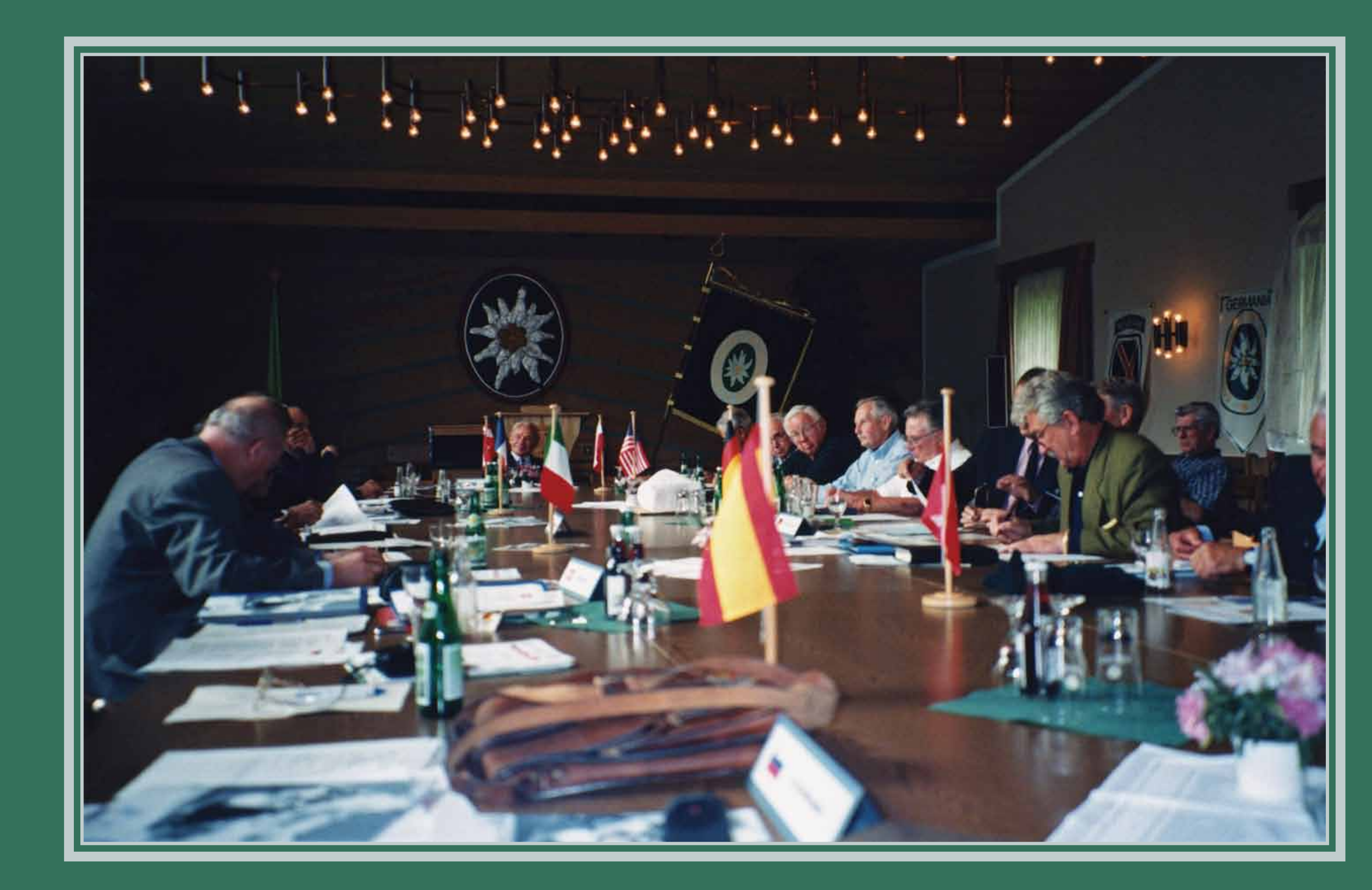
Congress in Bad Reichenhall, 1996

11<sup>th</sup> Congress: Bad Reichenhall, Germany, 1996